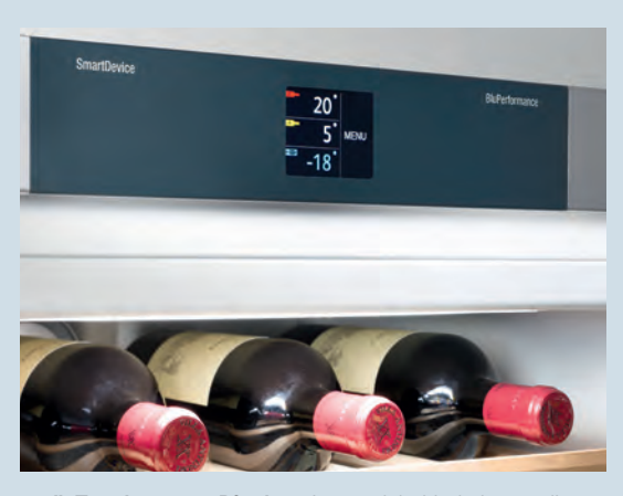
2.4" Touchscreen Display: Located behind the appliance door, this high-resolution and high-contrast 2.4" touchscreen display can be read from any angle. Stored menu options are Intuitive and easy-to-operate.