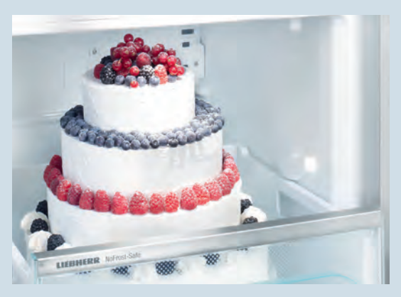
VarioSpace: Nearly all freezers include drawers and glass shelves that can be conveniently removed to create extra storage space. It's Liebherr's very practical solution to quickly accommodate even bulky items.

Introducing Liebherr's SWTNes 4265 freezer with wine cellar compartment from the BluPerformance range.