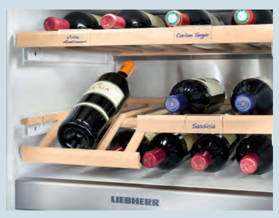
Presentation Shelf: Display your prized possessions or simply store open bottles on the presentation shelf located within the dual zone wine cellar.