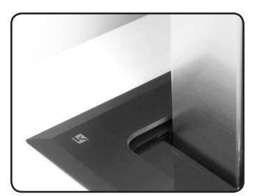
Sleek bevelled edge

* Flexi-Zone Function Electronic Touch Control Booster Function on all Zones Easy Clean Induction Surface