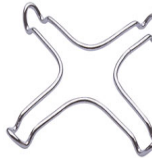
GRM Gas hobs moka support