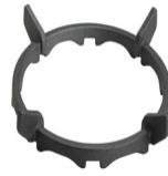
WOKGHU Cast-Iron WOK Support