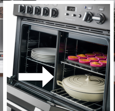
Energy saving panel