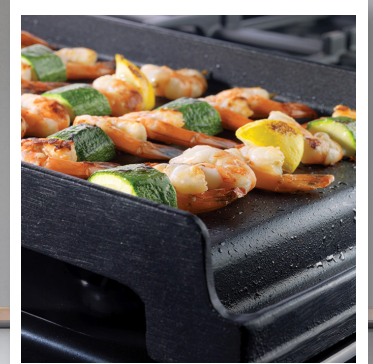
Teppanyaki Style Griddle Plate (gas hob only)