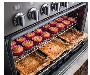
Pyrolytic cleaning - Carbonises cooking residue for easy cleaning (FXP only)

KEY: « Multi ring wok burner, > Litres based on European Standards | Measurements, ^Using assessed maximum demand. Not all zones can be used at once. Consult with a licensed electrician.