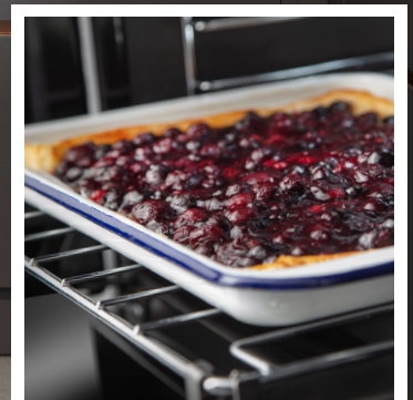
*NEW - telescopic rails (full oven mode)