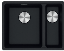
MRG660-35/15 SBR ON