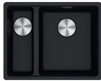
MRG660-35/15 SBL ON