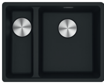
MRG660-35/15 SBL MB