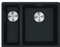
MRG260-35/15 SBL MB