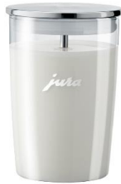
Glass milk container