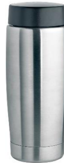
Stainless steel vacuum milk container