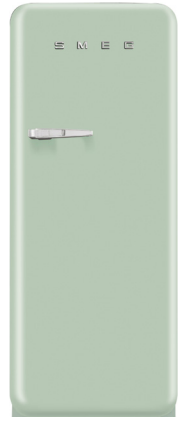
FAB28 Pastel Green RH | FAB28RPG3AU LH | FAB28LPG3AU