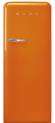
FAB28 Orange RH | FAB28ROR3 LH | FAB28LOR3