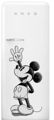
FAB28 Mickey Mouse RH | FAB28RDMM4 LH | FAB28LDMM4