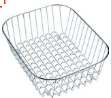
DB 448 Drainer Basket