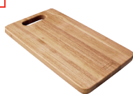
CB 932 Chopping Board