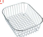
DB 448 Drainer Basket